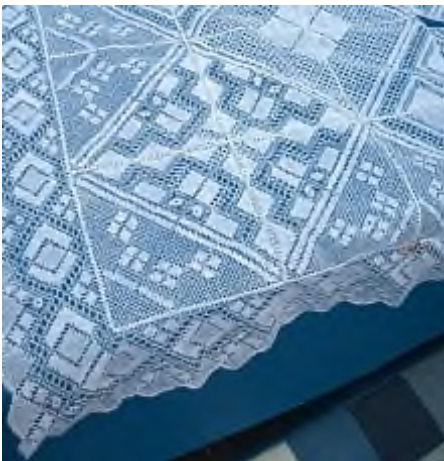
←Close up of a finished corner.

This will be included in her display at the Tillamook Latimer Quilt and Textile Center during the months of November and December 2015. There will be one block left on a pillow to show how the project was done and the rest assembled.